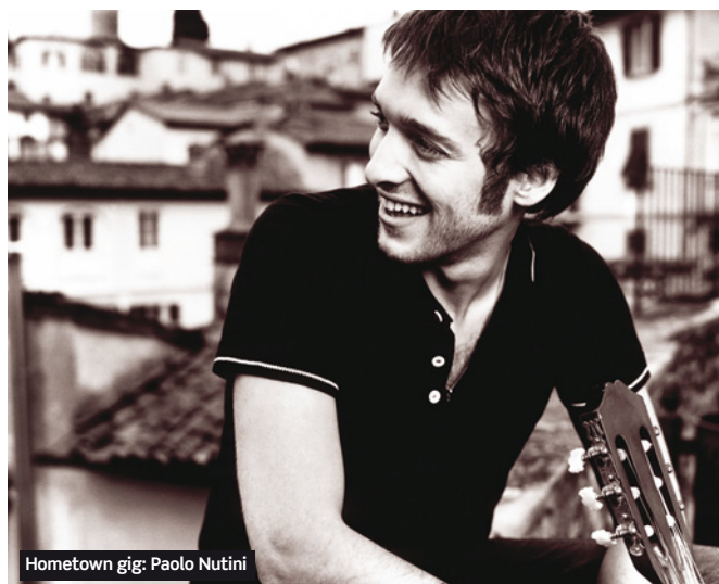
Hometown gig: Paolo Nutini

"I love the idea we are getting outside of London with Radio 2 Live," he says. "I often get people saying they wish they could hear In Concert around the UK. I am also